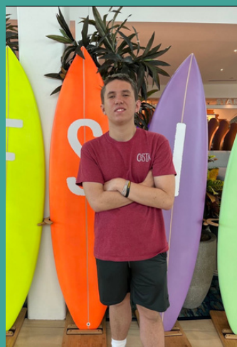
Web English as Buddy Director